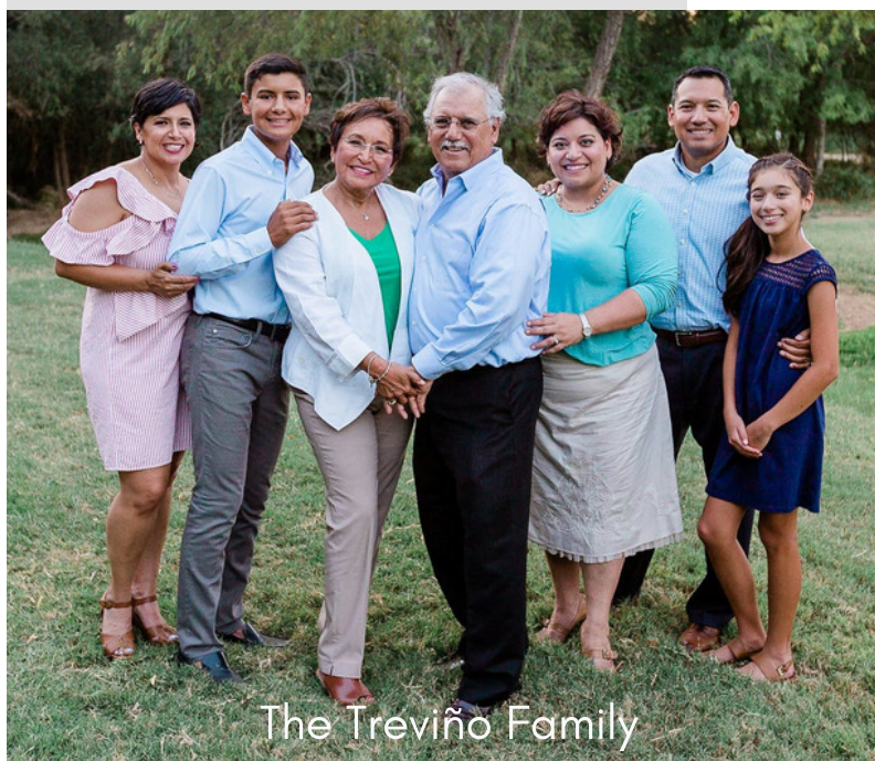
The Treviño Family